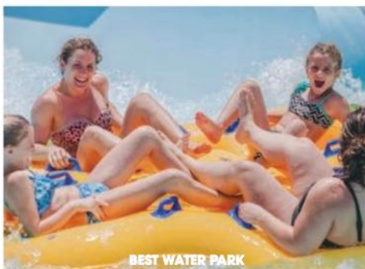
BEST WATER PARK