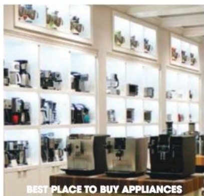
BEST PLACE TO BUY APPLIANCES

OUR READERS' FAVORITES IN MORE THAN 80 CATEGORIES